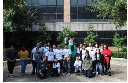
Photos of the 2019 I Madonnari participants and winners